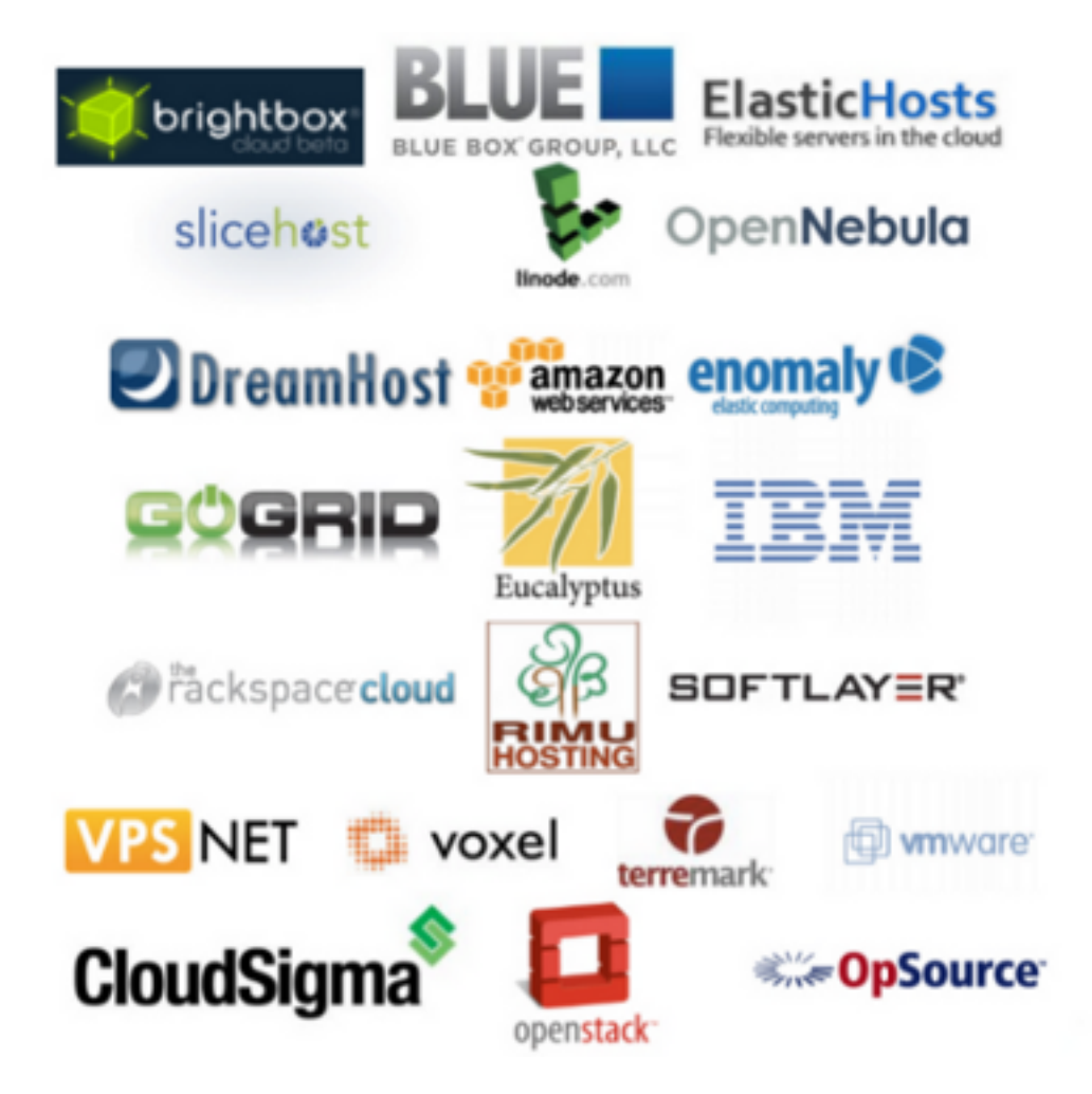
Figure 1: A subset of supported providers in Libcloud.